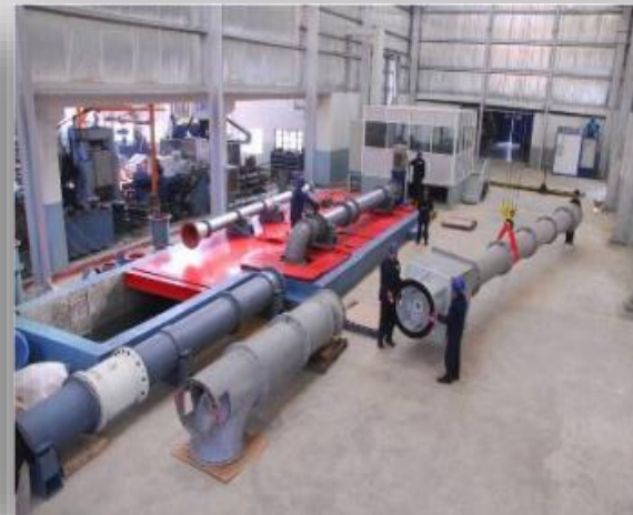
Test Bed Facility