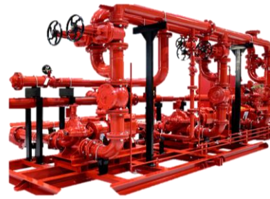
Fire Fighting Pump